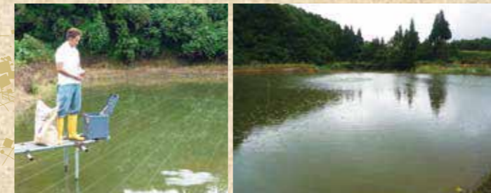
A large Niigata field pond in full blossom We feel Saki-Hikari® is a necessity for rapid growth and the development of first-rate koi.

We keep only a small number of koi in each field pond to allow them ample room to build volume. Our koi parents are also kept in the field ponds.