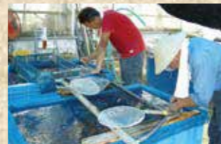
The young koi selection process After several culling operations, the number of saleable young fish is usually around 8,000 per variety.

Since the outbreak of KHV, larger entries are usually placed in an individual pools and examined individually instead of by direct comparison. So having a strong impact in their appearance is essential to win in a koi show. Making a strong impact in the judges' eye is essential to be a koi show winner.