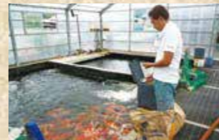
Hoshikin Kohaku gathering for their Saki-Hikari® feeding A truly splendid offering of koi.