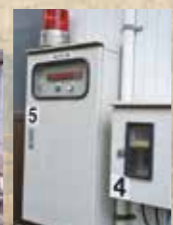
Pond water temperature recording station