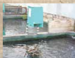
Automatic feeding machine

Furthermore, their indoor ponds are equipped with automatic feeding machines, high-level oxygen generating equipment, high-volume aeration equipment, temperature/pH monitors, UV sterilization and a number of other unique procedures to maintain ultimate water quality. All the technical data collected through these various processes is a key to their cultivation of prize winning koi.