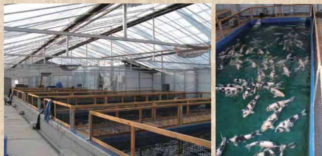
Inside the newly built grow out house (construction completed in 2010) A 60-ton pond full of Shiro-Utsuri looks like a Sumie monochrome work of art.