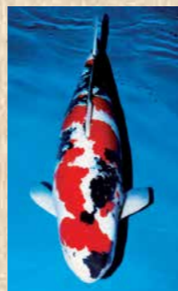
※The 41st All Japan Koi Show, Gigantic Champion, 90 Bu Showa Sanshoku