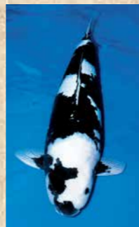
※The 36th All Japan Koi Show, Kokugyo Prize, 85 Bu Shiro-Utsuri