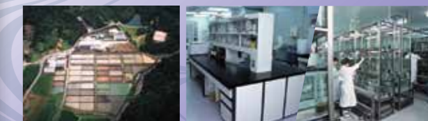
Hikari Aquatic Laboratory, located in Yamasaki Koi Farm with site area 33,000m 2 . Integrated experiment room 445 aquariums are installed to perform various experiments