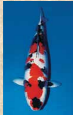
The 49th Niigata Nishikigoi Show (2009) , Second Grand Champion, Over 80 Bu Showa Sanshoku ("Chokansho")