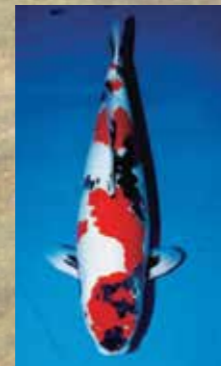
The 50th Niigata Nishikigoi Show (2010) , Grand Champion, Over 80 Bu Showa Sanshoku

This memorable koi's strongest charm is its white skin which became conspicuous when the fish was three years old. While maintaining its beauty, the fish grew to 86 cm at the age of seven and won the grand championship for the first time.