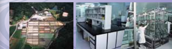
Hikari Aquatic Laboratory, located in Yamasaki Koi Farm with site area 33,000m 2 .