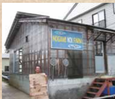
The clean and tidy indoor pond house of the Nogami Koi Farm

Located in the city of Nagaoka, Niigata, the farm has a 44 year breeding history. They produce a total of 1,000,000 (yes, million) koi annually using six Kohaku and three Showa in their spawning process using four indoor pond houses and 50 field ponds (Approximately five hectares of farming area). The Kohaku variety accounts for 80 % of their total output.