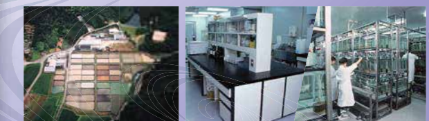
Hikari Aquatic Laboratory, located in Yamasaki Koi Farm with site area 33,000m 2 .